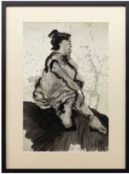
Her story about time and fear. ink on paper, 2020