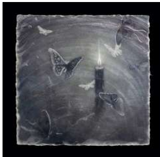
A Moment's Afire, 2020