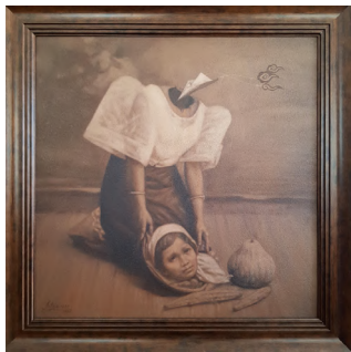
Nagmumurang Bilihin, 2020