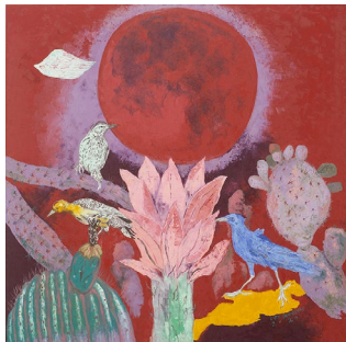
Flower Moon and Desert Sky , 2020