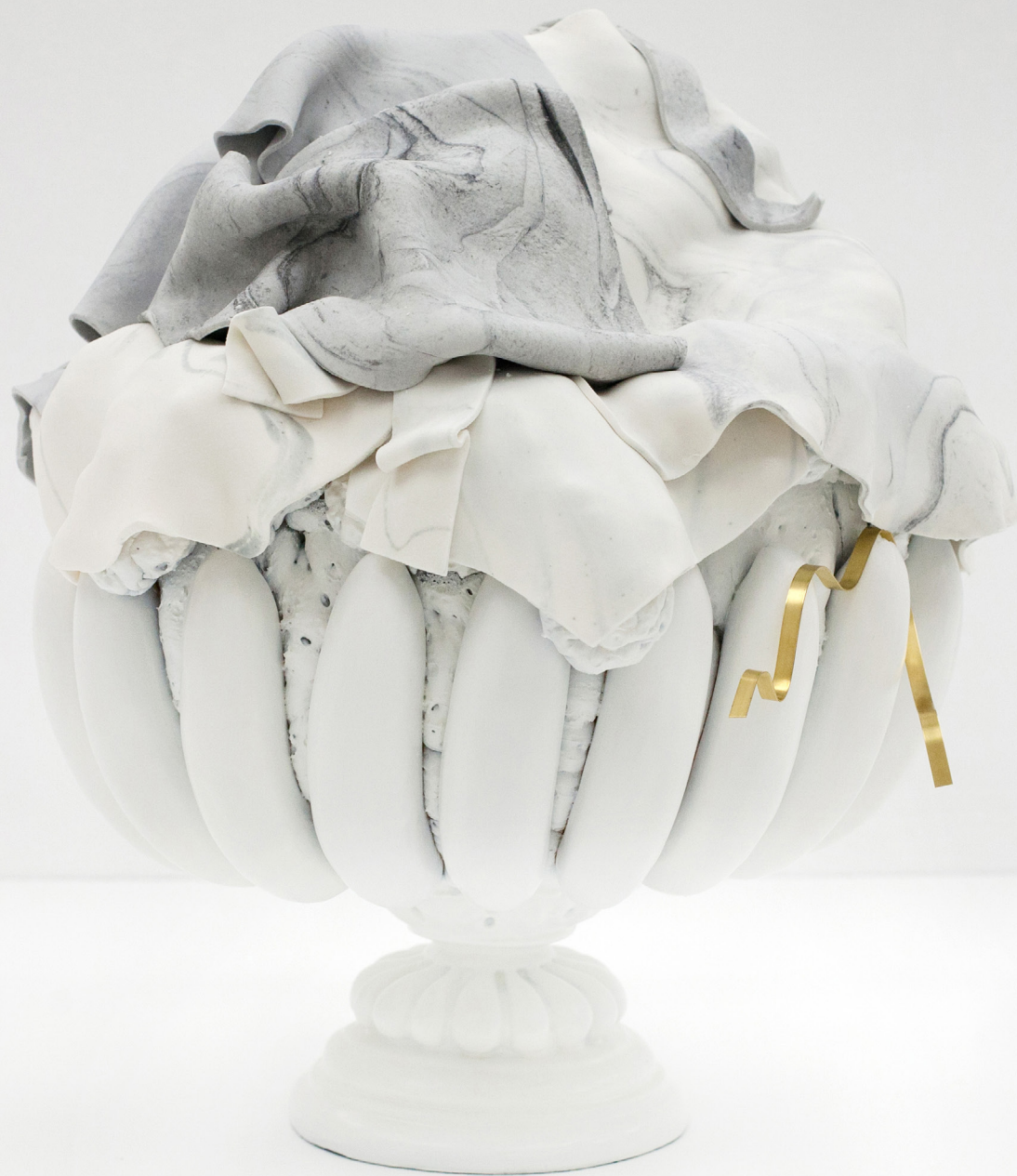
Untitled (Still Life 4) fiberglass resin, sugar paste, graphite, acrylic paint, brass strip 17h x 15w in (43.18h x 38.10w cm) 2017