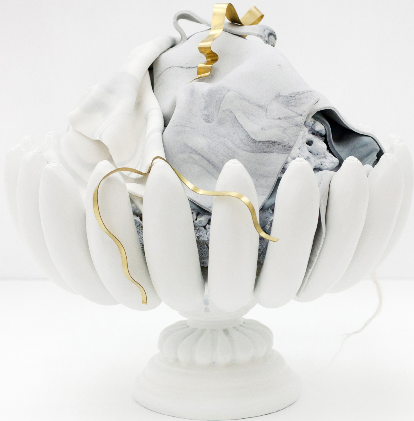
Untitled (Still Life 6) fiberglass resin, sugar paste, piña fiber, graphite, acrylic paint, brass strip 14h x 15w in (35,56h x 38,10w cm) 2017