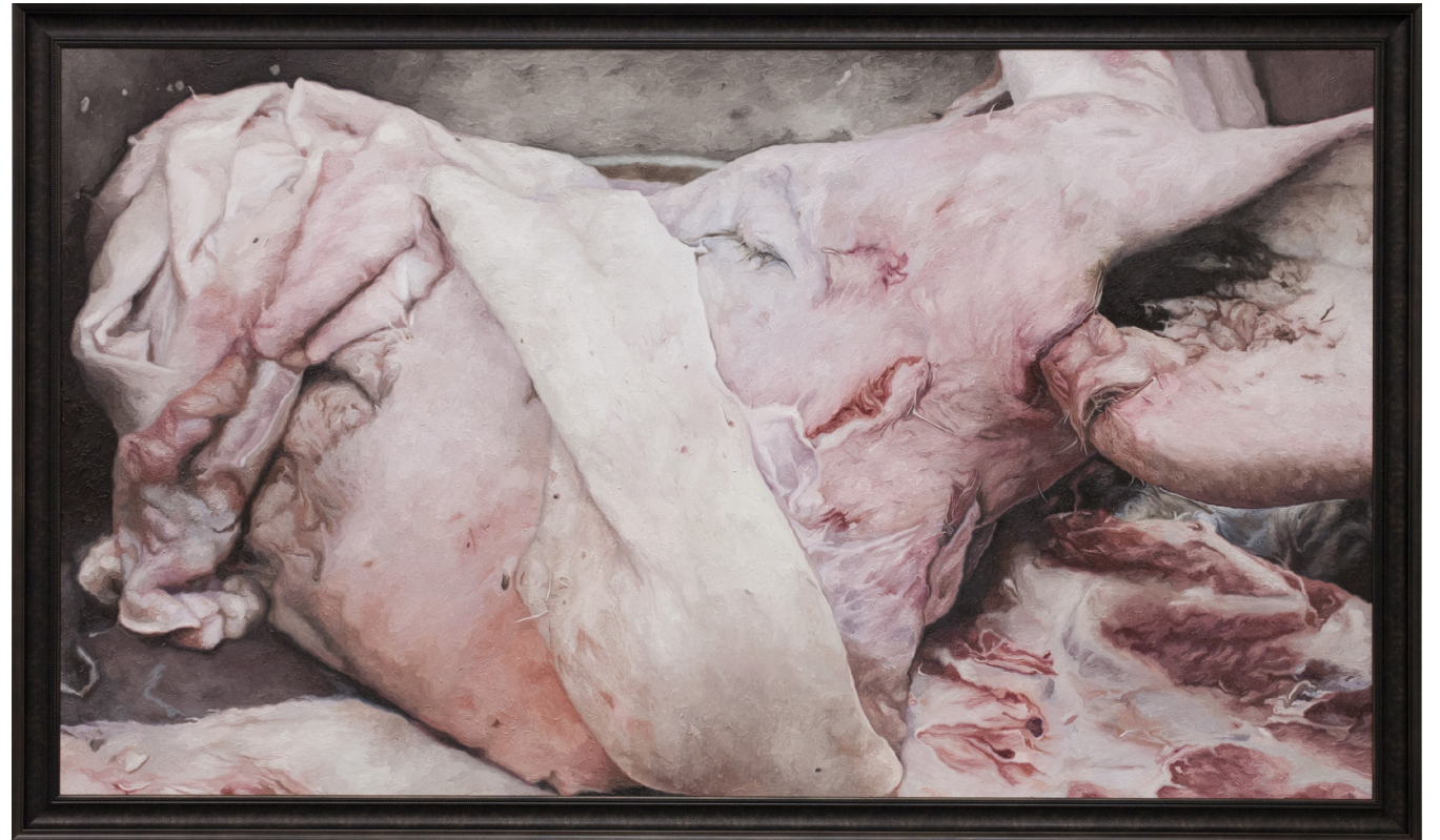
Untitled (Still Life 2) oil on canvas 48h x 84w in (121.92h x 213.36w cm) 2017