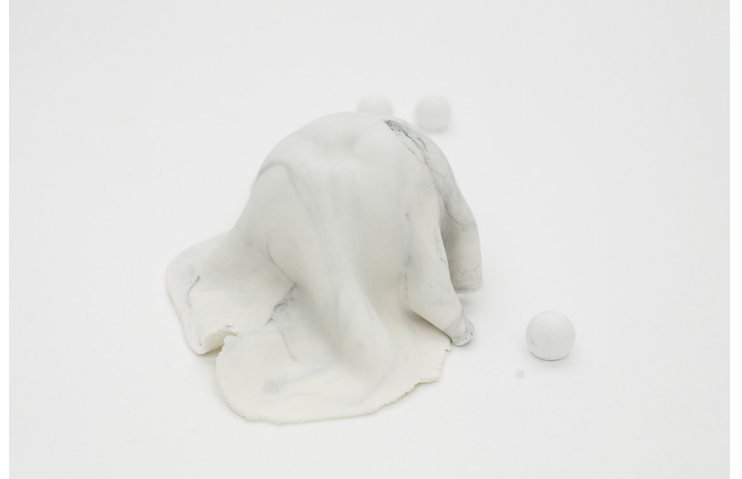
Untitled (Still Life 11) sugar paste, plaster, graphite dimension variable 2017