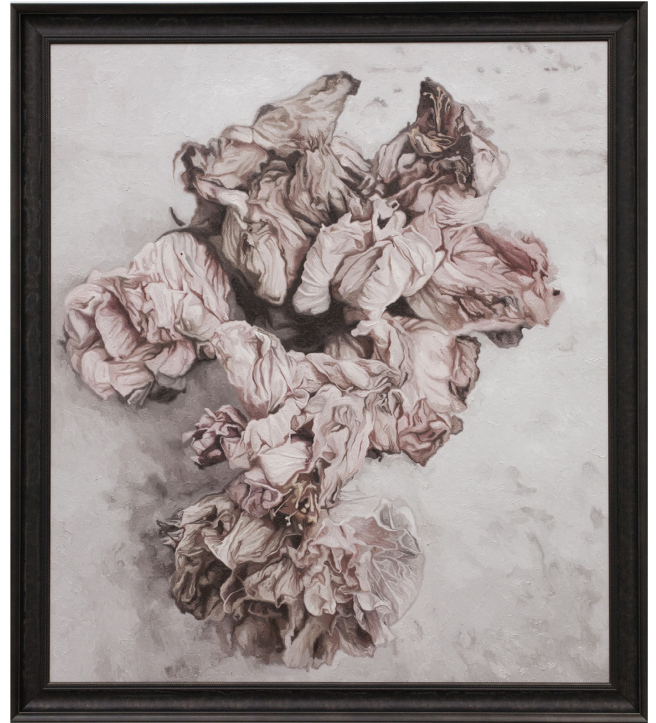
Untitled (Still Life 7) oil on canvas 48h x 42w in (121.92h x 106.68w cm) 2017