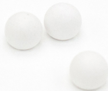
Untitled (Still Life 3) piñon fiber, plaster 7 x 2.25 in • 17.78 x 5.71 cm (corn) 55 x 45 in • 13.97 x 11.43 cm (squash) 2017