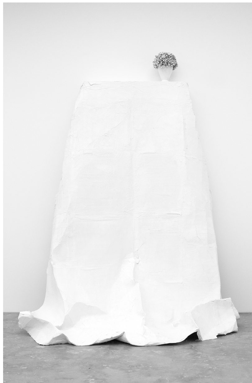
Untitled (Still Life 9) plaster, fabric, plastic plant, paint 116.50h x 94w in • 295.91h x 238.76w cm (plastic plant included) 2017