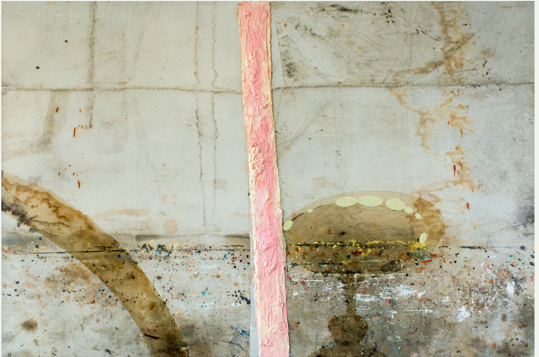
Kangkong ( Ipomoea aquatic ) mixed media 72 x 108 in · 182.9 x 274.3 cm 2015