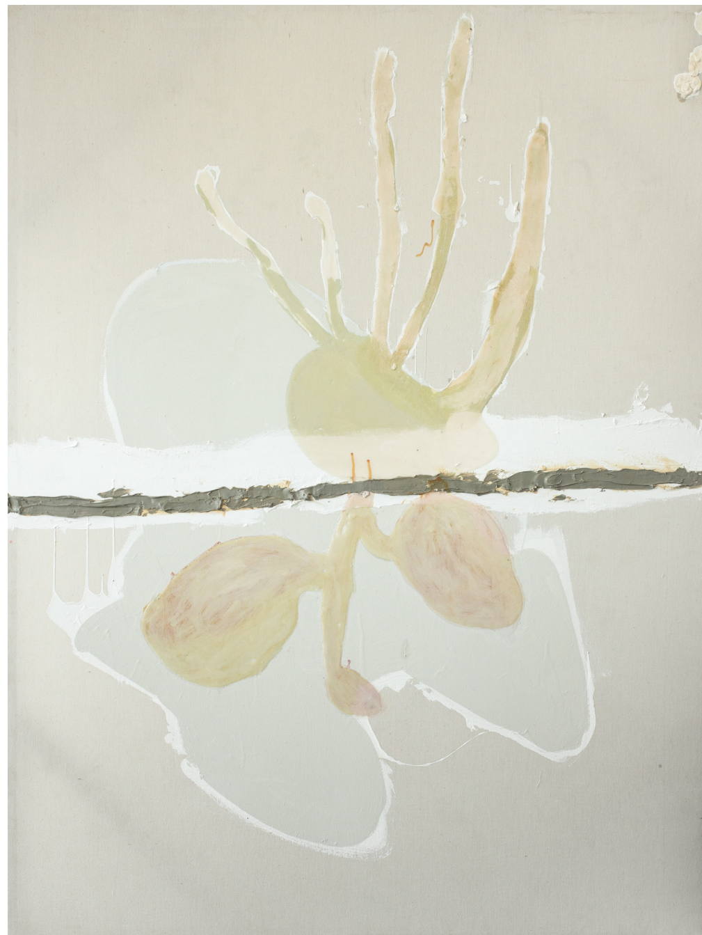
Pole Sitao (Vigna unguiculata) mixed media 72 x 48 in · 182.9 x 121.9 cm 2015