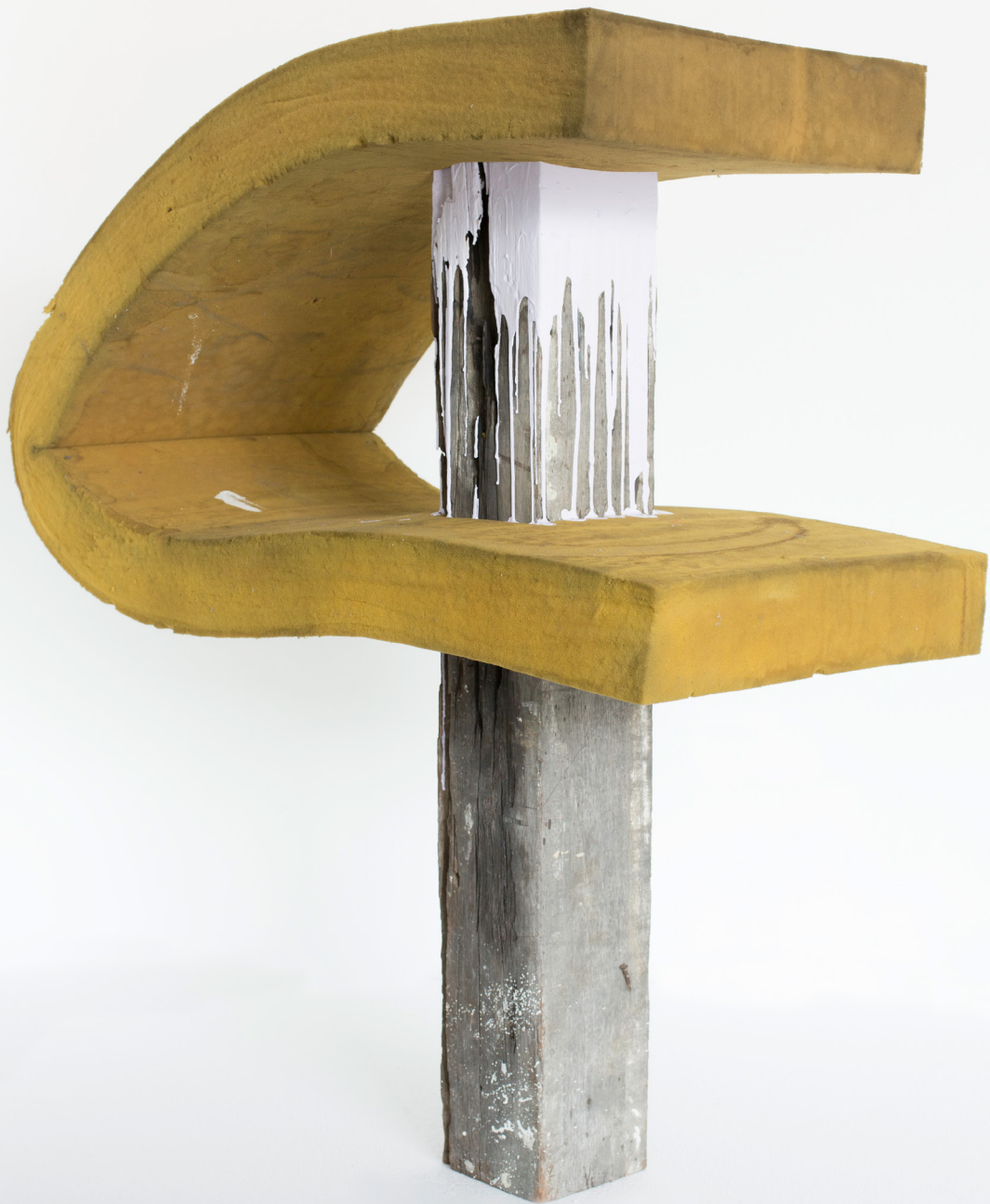
Half Full 02 mixed media 37.4 x 17.3 x 42.3 in · 95 x 44 x 107.5 cm 2015