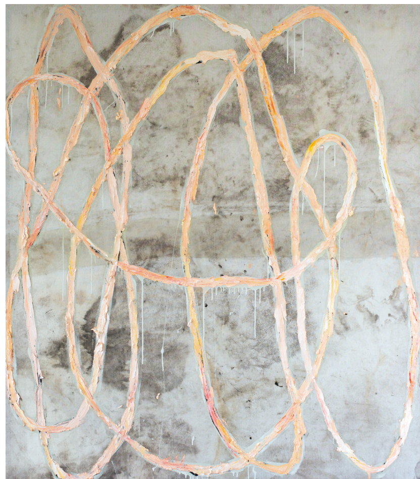
Ampalaya acrylic emulsion, oil on canvas 60 x 52.5 in · 152.4 x 133.4 cm 2015