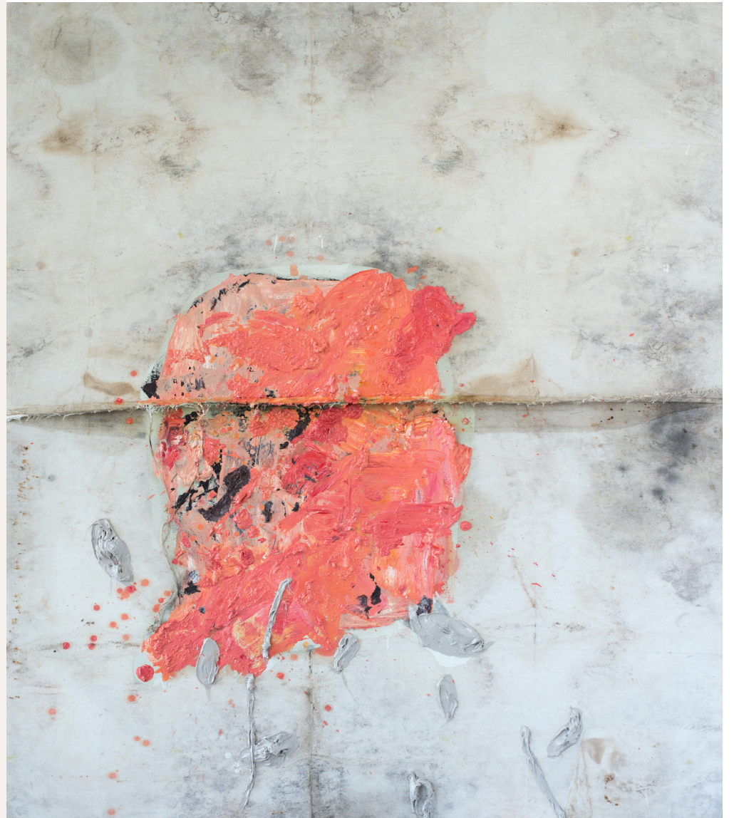
Tomato acrylic emulsion, rubber glue, oil on canvas 60 x 52.5 in · 152.4 x 133.4 cm 2015