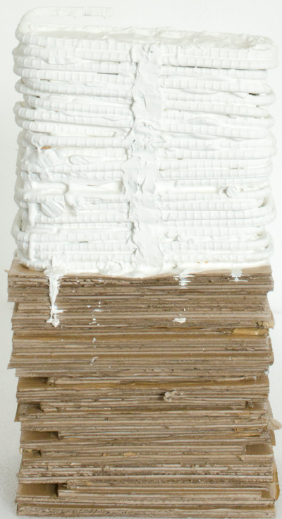
Half Full 03 mixed media 10 x 7.3 x 18.9 in · 25.5 x 18.5 x 48 cm 2015