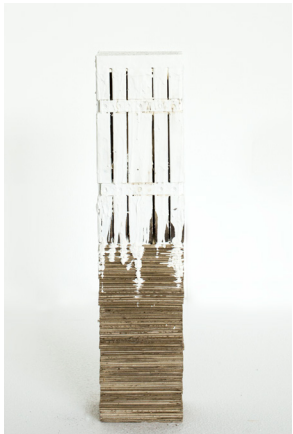
Half Full 04 mixed media 5.2 x 4 x 22.8 in · 13.2 x 10 x 58 cm 2015