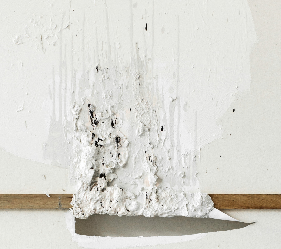
BERNARDO PACQUING | HALF FULL