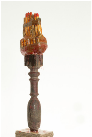
Half Full 01 mixed media 7.3 x 4.9 x 40.2 in · 18.5 x 12.5 x 102 cm 2015