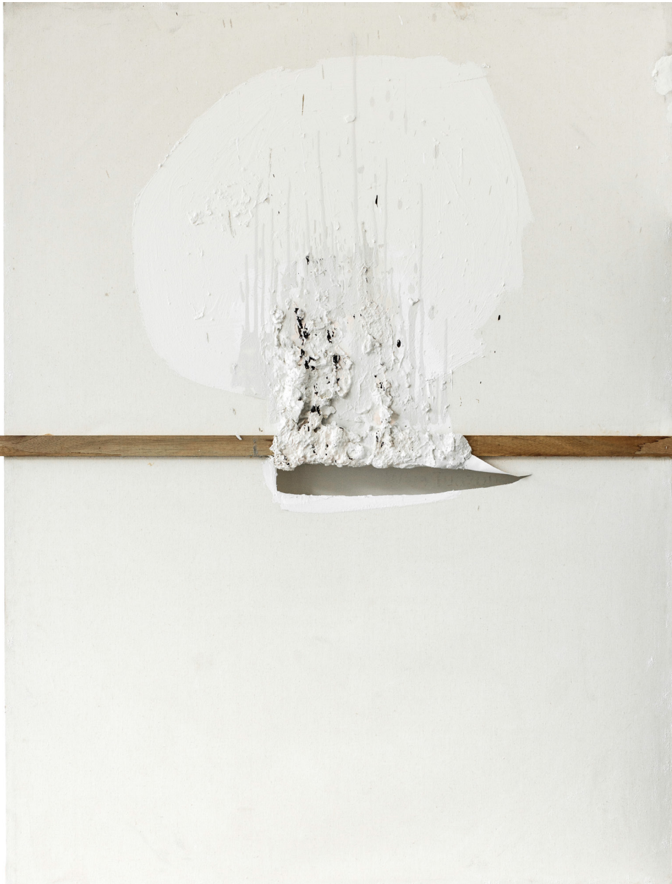
Radish ( Raphanus sativus ) mixed media 72 x 54 in • 182.9 x 137.2 cm 2015

Pacquing's paintings. He also treats canvas as a sculptural space in some works: ripping and tearing through some parts and sewing up others to create plays between positive and negative space.