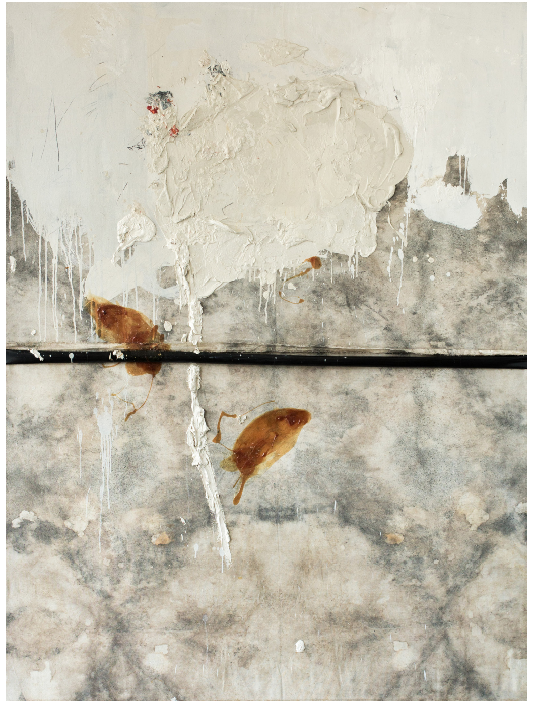
Bell Pepper ( Capsicum annuum ) mixed media 72 x 48 in • 182.9 x 121.9 cm 2015