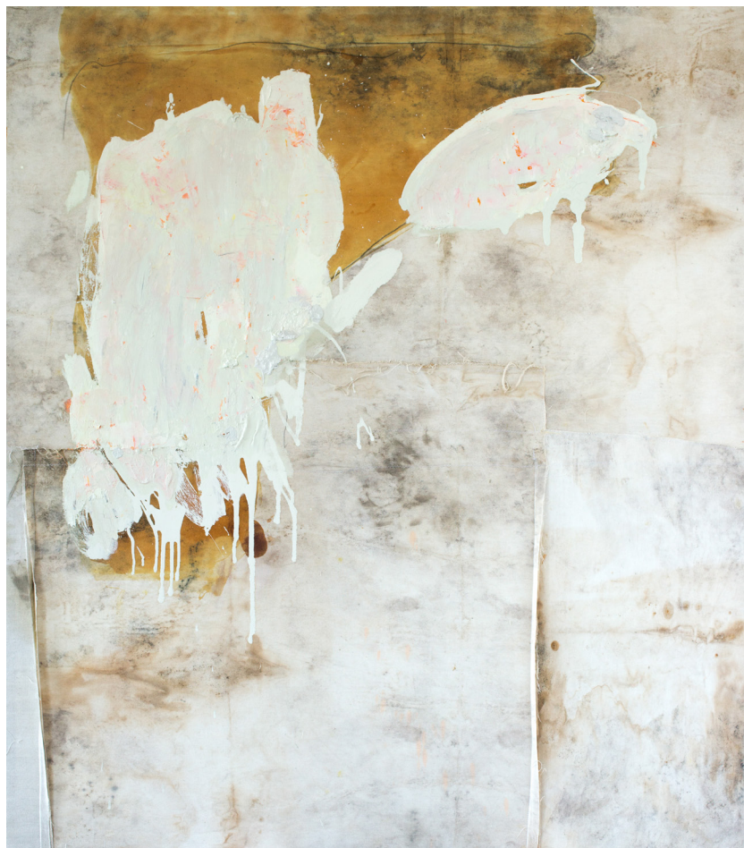
Okra contact cement, oil on canvas 60 x 52.5 in · 152.4 x 133.4 cm 2015