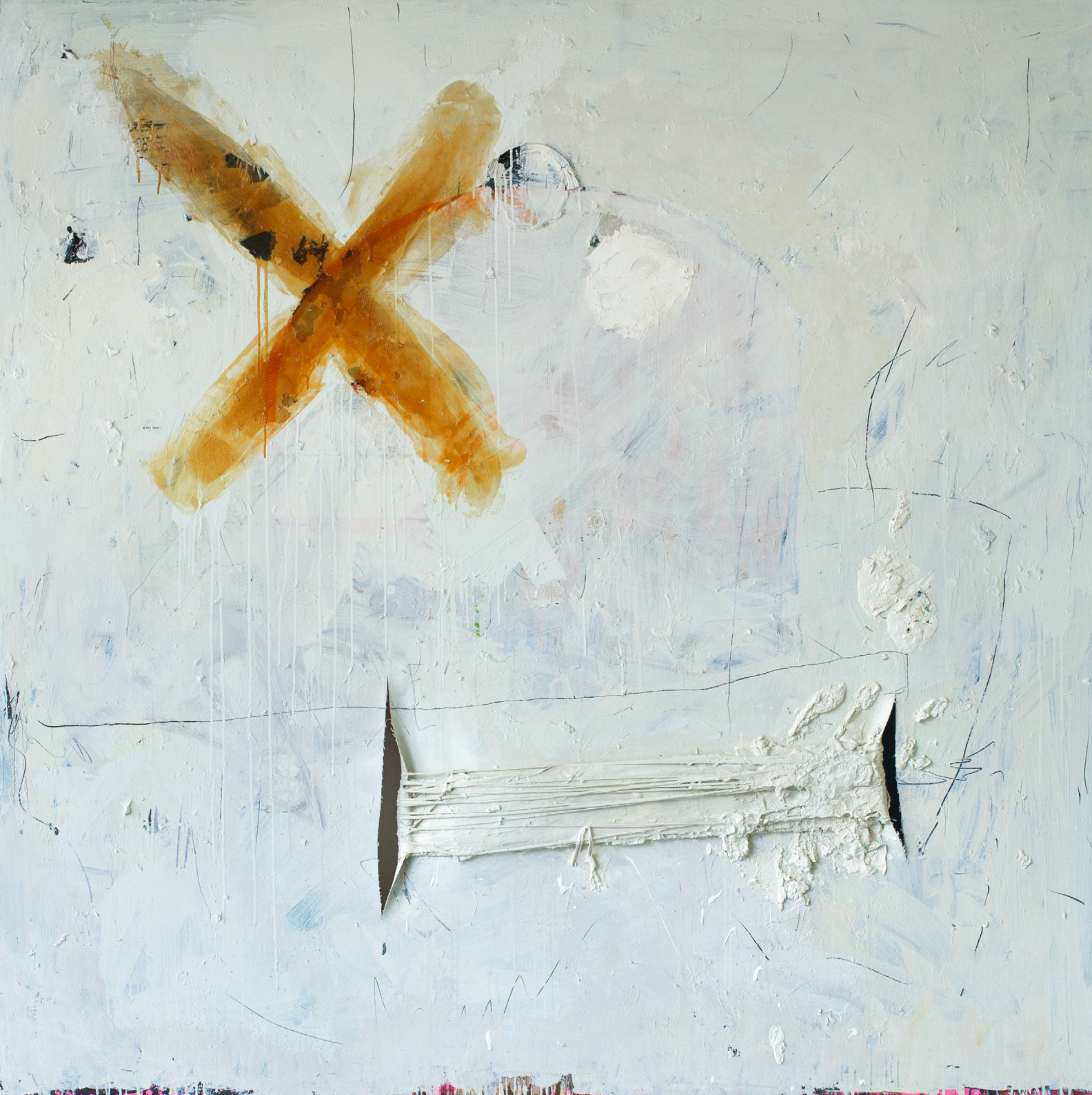
Dutch Bucket Cycle mixed media 80 x 80 in • 203.2 x 203.2 cm 2015