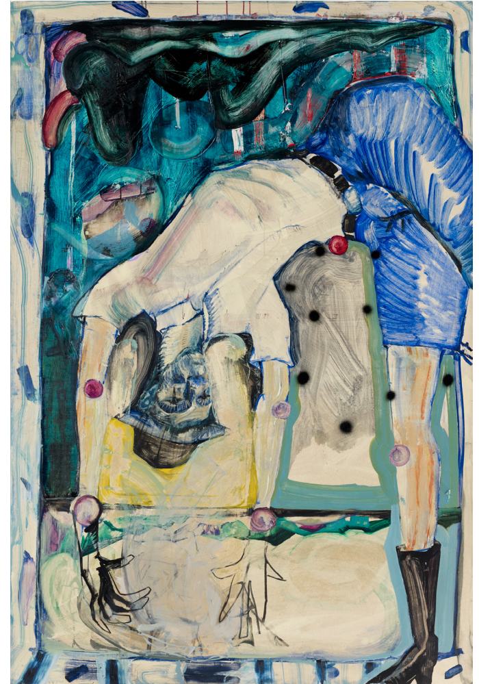
Bending Down , 2017 oil on Masonite 70.87h x 48.03w in 180h x 122w cm