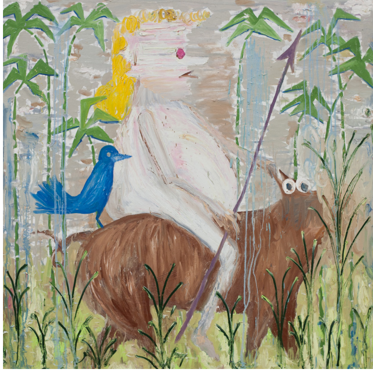
Border Patrol , 2018 oil on canvas 53.50h x 54w in 135.89h x 137.16w cm