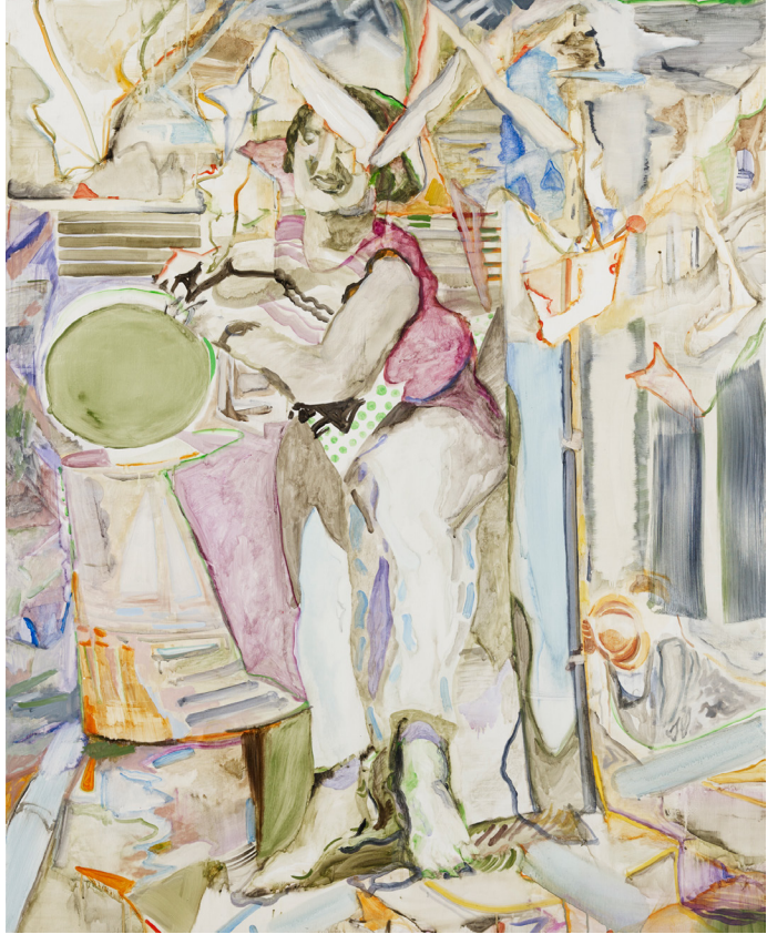
Spilling Water , 2017 oil on canvas 60.08h x 48.03w in 152.60h x 122w cm