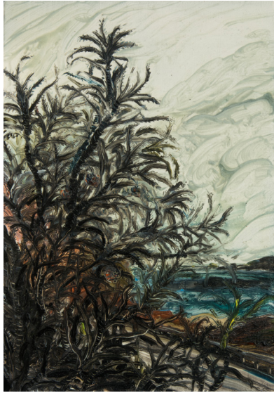
Lintou 2 , 2017 oil on canvas 10.83h x 7.48w in 27.50h x 19w cm