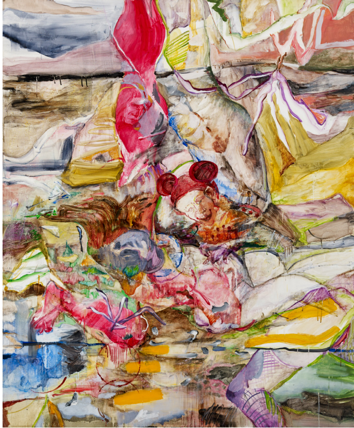
Jungle Game , 2017 oil on canvas 66.93h x 55.12w in 170h x 140w cm