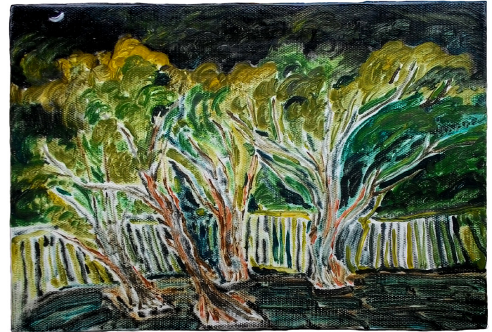
Road Trip 2, 2017 oil on canvas 9.45h x 13.78w in 24h x 35w cm