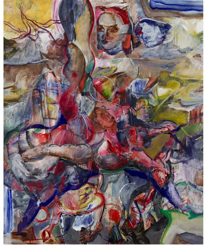
Carousel , 2017 oil on canvas 66.93h x 55.12w in 170h x 140w cm