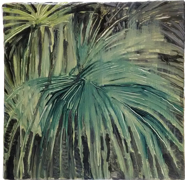
Phantom of the Trees 5 , 2017 oil on canvas 7.87h x 7.87w in 20h x 20w cm