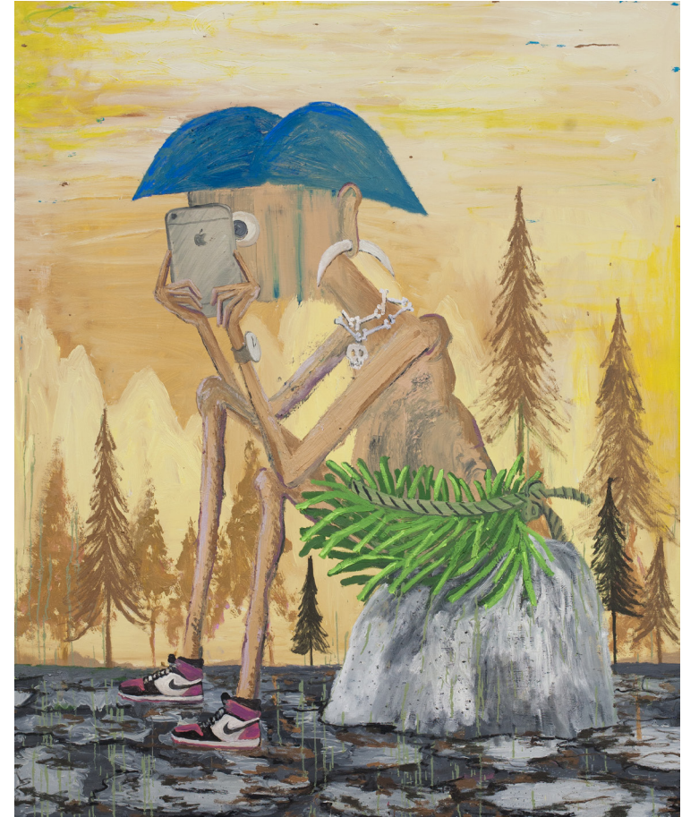
The Thinker , 2018 oil on canvas 73.23h x 60.24w in 186h x 153w cm