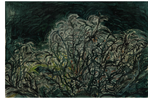
Phantom of the Trees 1 , 2017 Phantom of the Trees 2 , 2017 Phantom of the Trees 3 , 2017 oil on canvas 9.45h x 13.78w in 24h x 35w cm