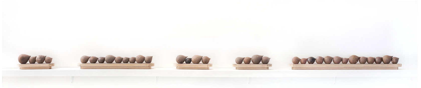
River , 2018 Terra Rossa, clinker, wood 3.94h x 66.93w x 3.35d in 10h x 170w x 8.50d cm