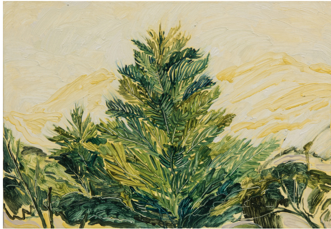
Phantom of the Trees 6, 2017 oil on canvas 17.72h x 23.62w in 45h x 60w cm