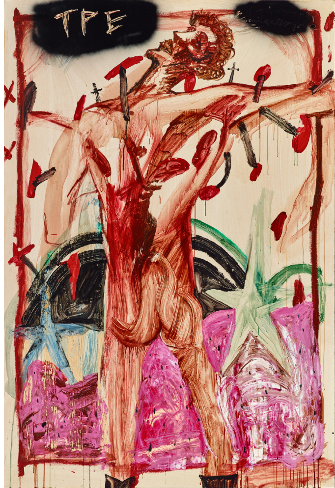
Christ in Boots , 2016 oil on Masonite 70.87h x 48.03w in 180h x 122w cm