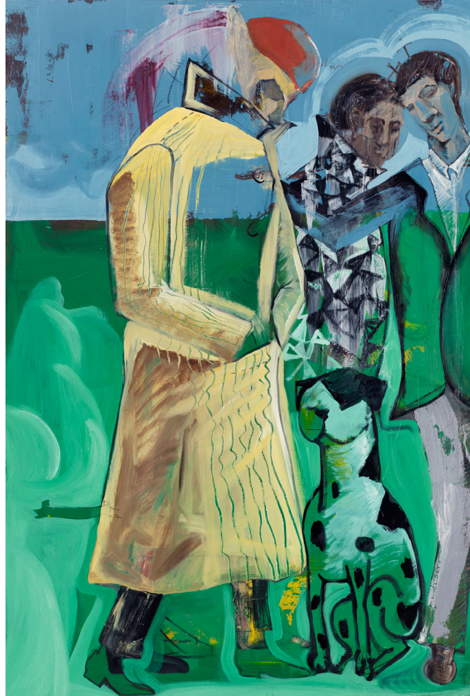
The Stranger , 2017 oil on Masonite 70.08h x 47.24w in 178h x 120w cm