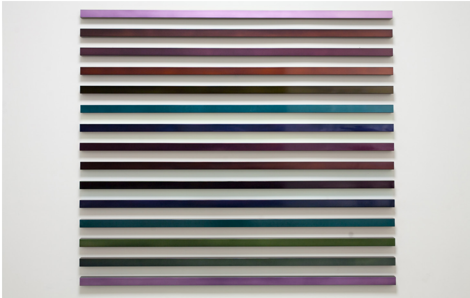
SYAGINI RATNA WULAN Halfway To You , 2018

lacquer, resin and steel 1.97 x 1.97 x 78.74 in • 5 x 5 x 200 cm each (15 pcs)