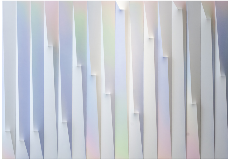
SYAGINI RATNA WULAN I see rainbow , 2018

lacquer on shaped canvas 66.93h x 96.06w x 1.97d in 170h x 244w x 5d cm