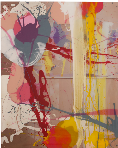
ARIN DWIHARTANTO SUNARYO U ees I , 2018