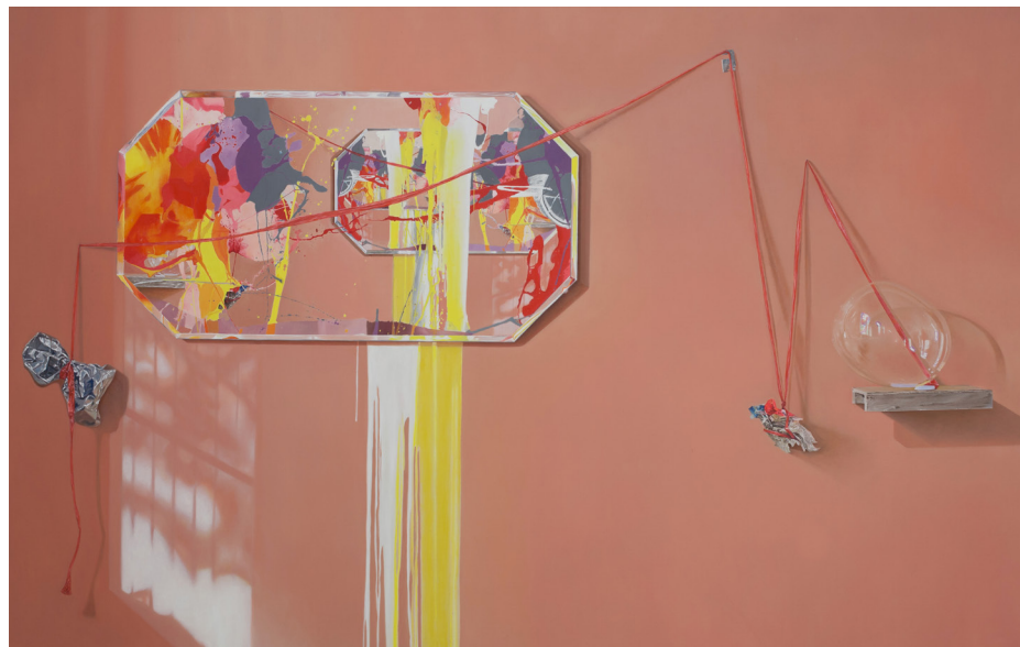
SYAGINI RATNA WULAN I see you , 2018