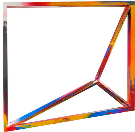
ARIN DWIHARTANTO SUNARYO Looking Through You , 2018

pigmented resin 59.45h x 59.45w x 5.51d in 151h x 151w x 14d cm