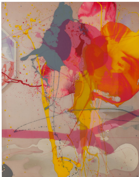
pigmented resin and digital print on wooden panel 42.91h x 120.08w x 1.97d in 109h x 305w x 5d cm