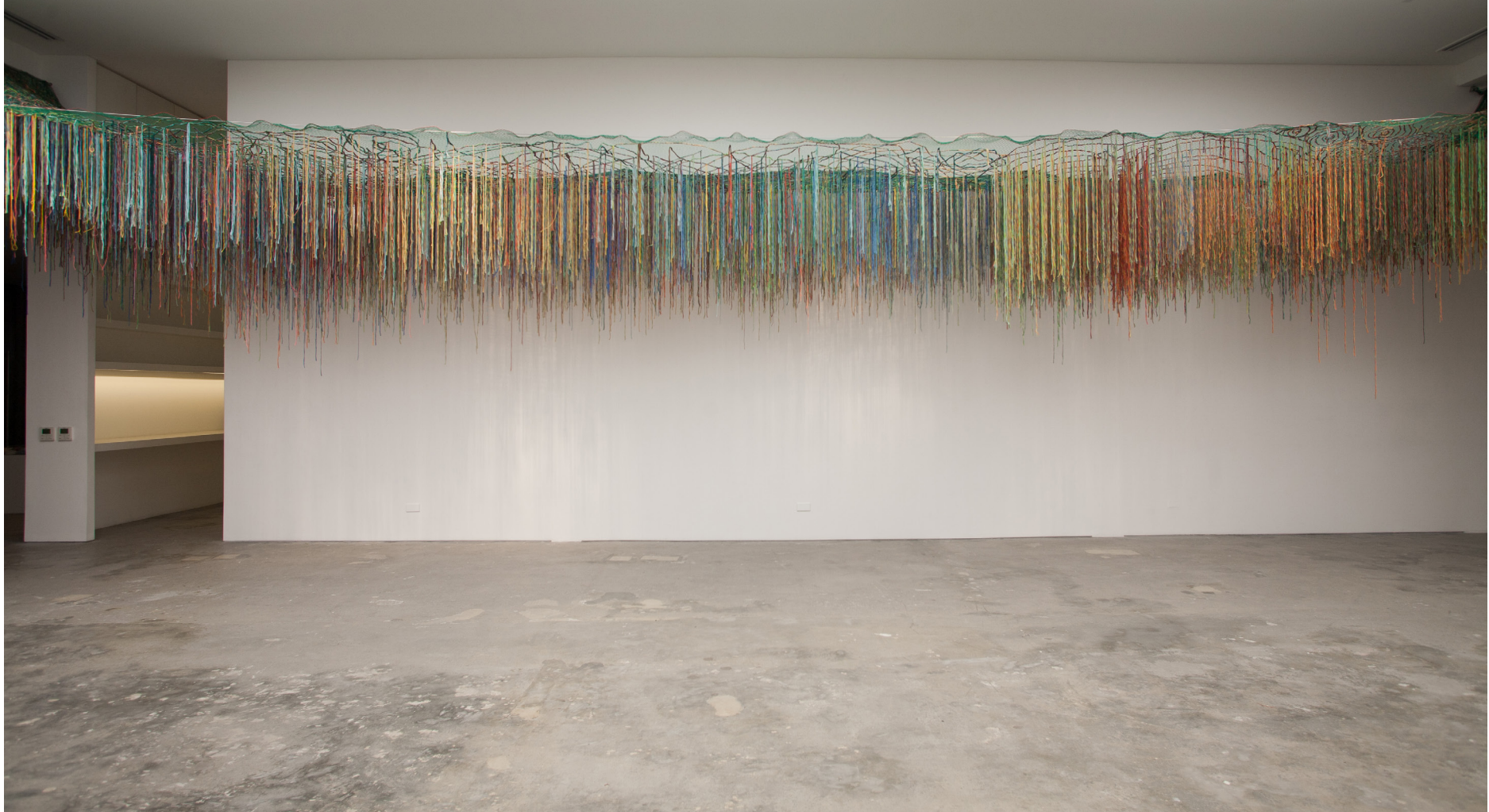
BUHAY , 2017 thread, nylon net dimensions variable