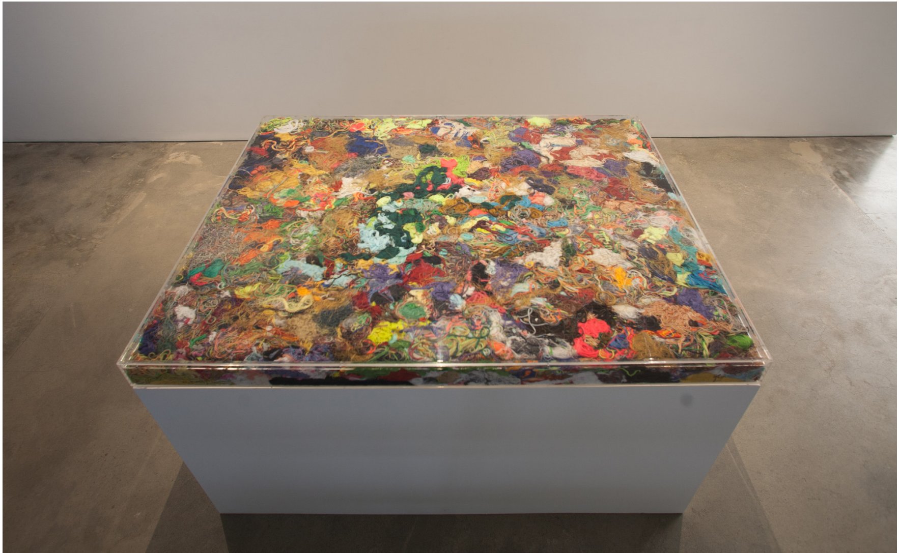
GROUND , 2017 thread on acrylic glass 42.90h x 54.50w x 3.25d in 108.97h x 138.43w x 8.26d cm