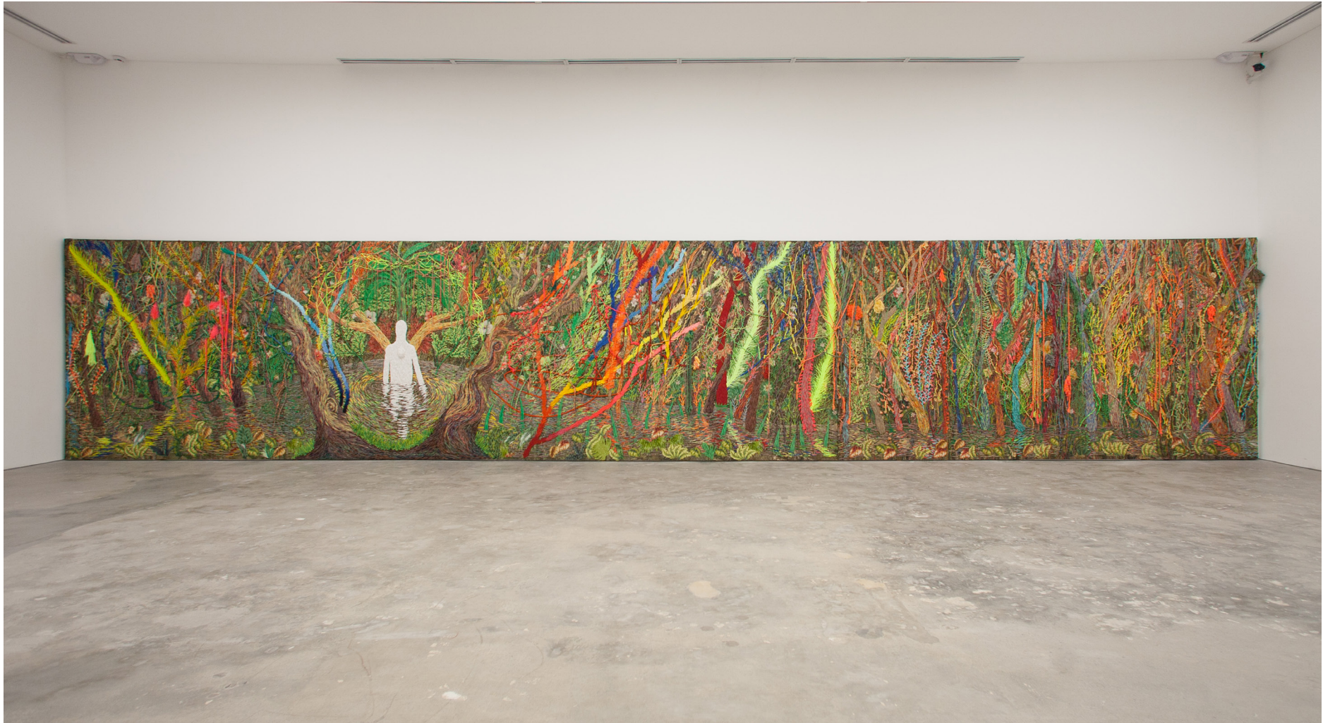
BUHAY , 2018 thread, acrylic, textile cloth 96h x 516w in 243.84h x 1310.64w cm