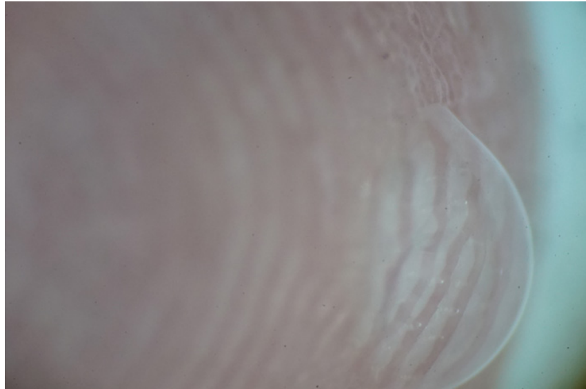
Sudor Klasira #1 , 2020 single channel HD video (00:05:35 min. loop), no sound Edition 1 of 3