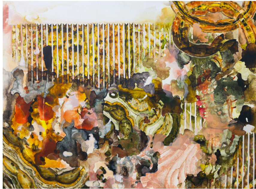
Sudor Klasira #3 , 2020 acrylic on canvas 57.87h x 79.13w in 147h x 201w cm