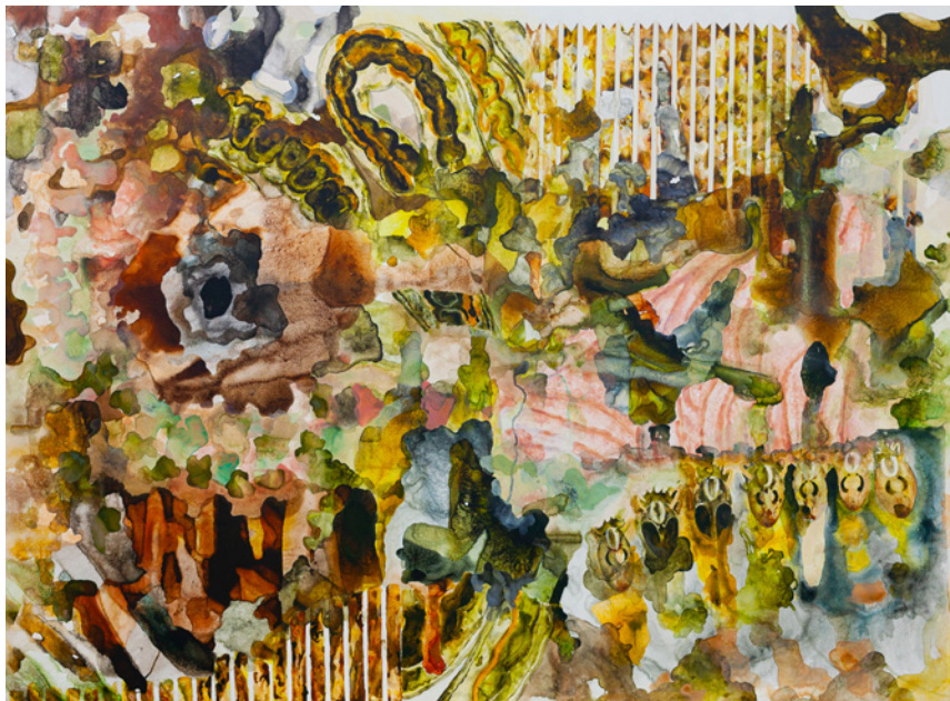
Sudor Klasira #2 , 2020 acrylic on canvas 57.87h x 79.13w in 147h x 201w cm