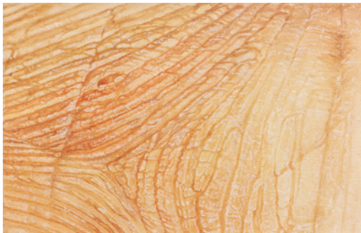
Sudor Klasira #4 , 2020 oil on canvas 7.87h x 11.81w in 20h x 30w cm