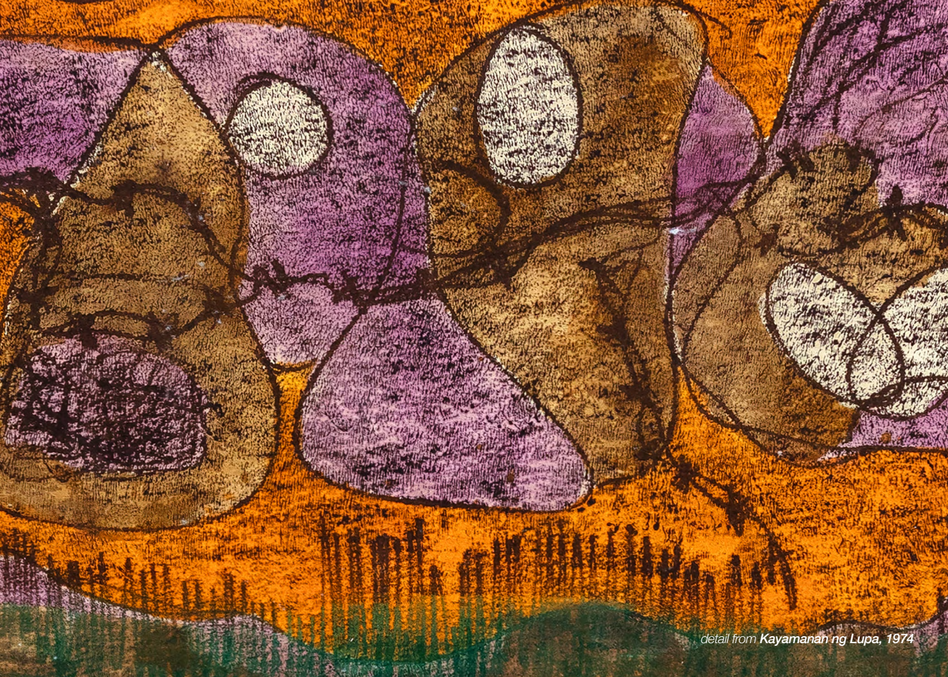
detail from Kayamanah ng Lupa , 1974