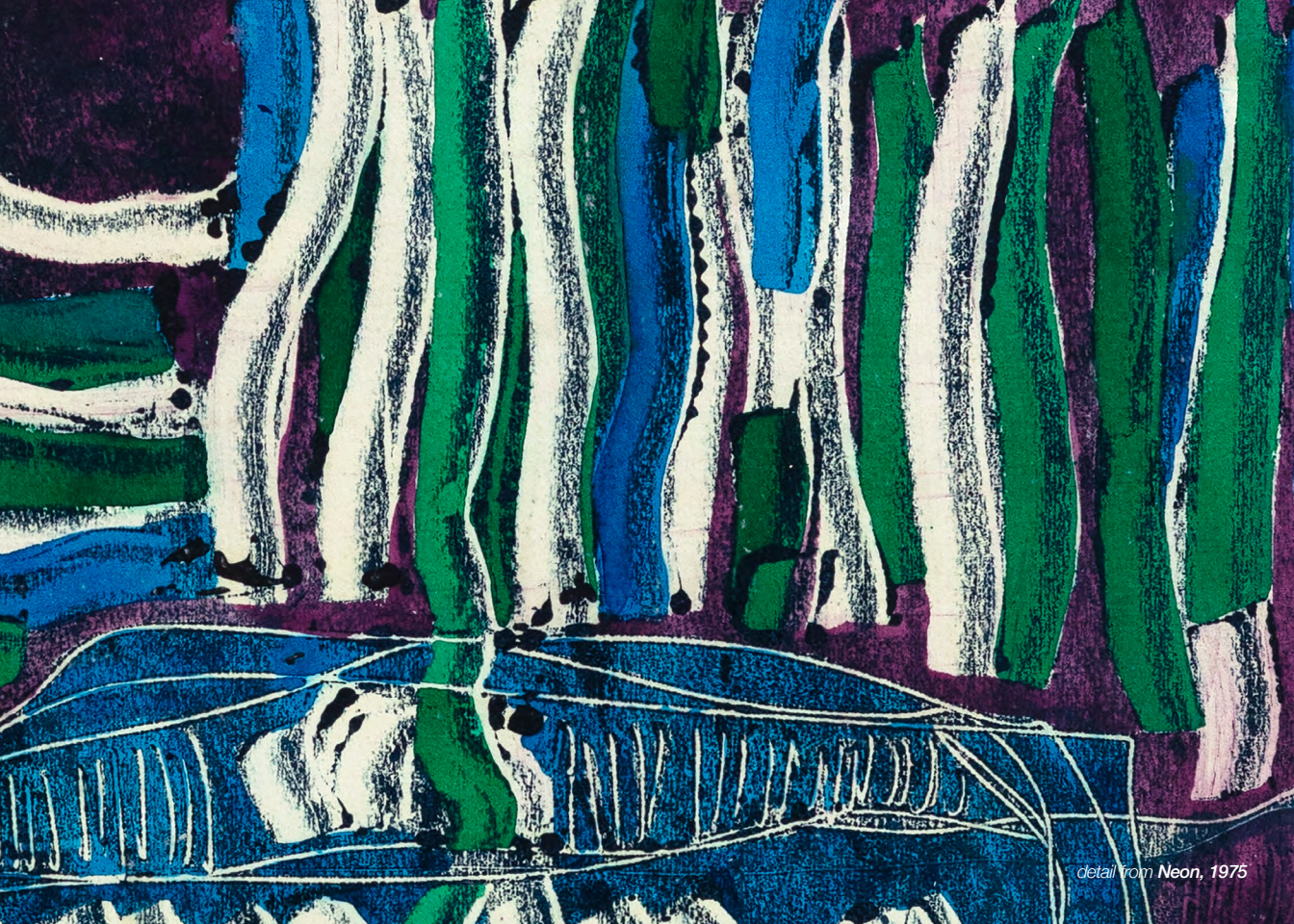
detail from Neon, 1975