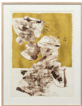
Laru-Laro 3, 1974