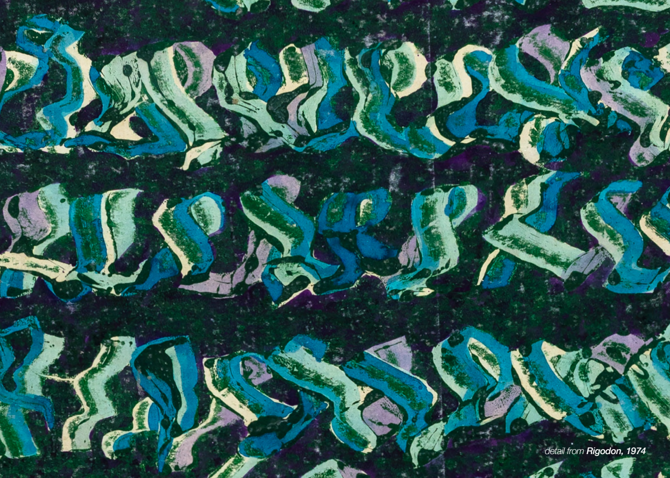
detail from Rigodon, 1974