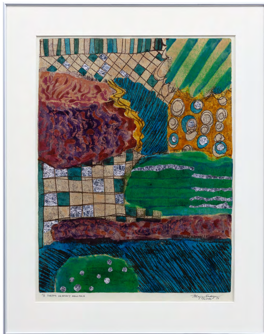
Tugtog ng Banda'y Halu-halo, 1975 dye resist on oil transfer and collage 27.2h x 21.18w in • 69.1h x 53.8w cm framed: 31.36h x 24.76w in • 79.4h x 62.9w cm Edition 1 of 1