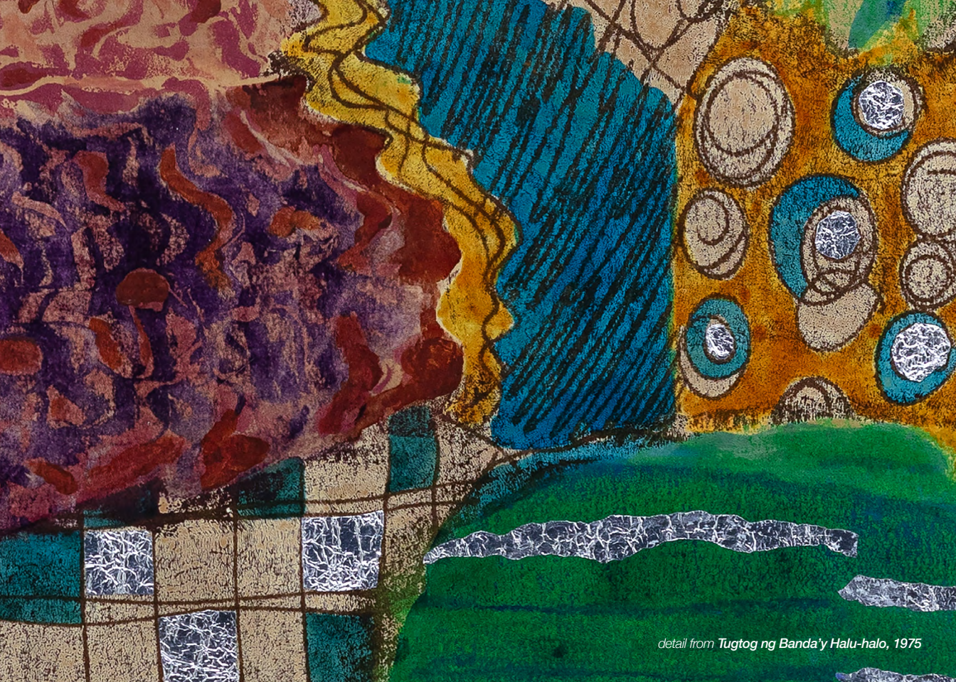
detail from Tugtog ng Banda'y Halu-halo, 1975