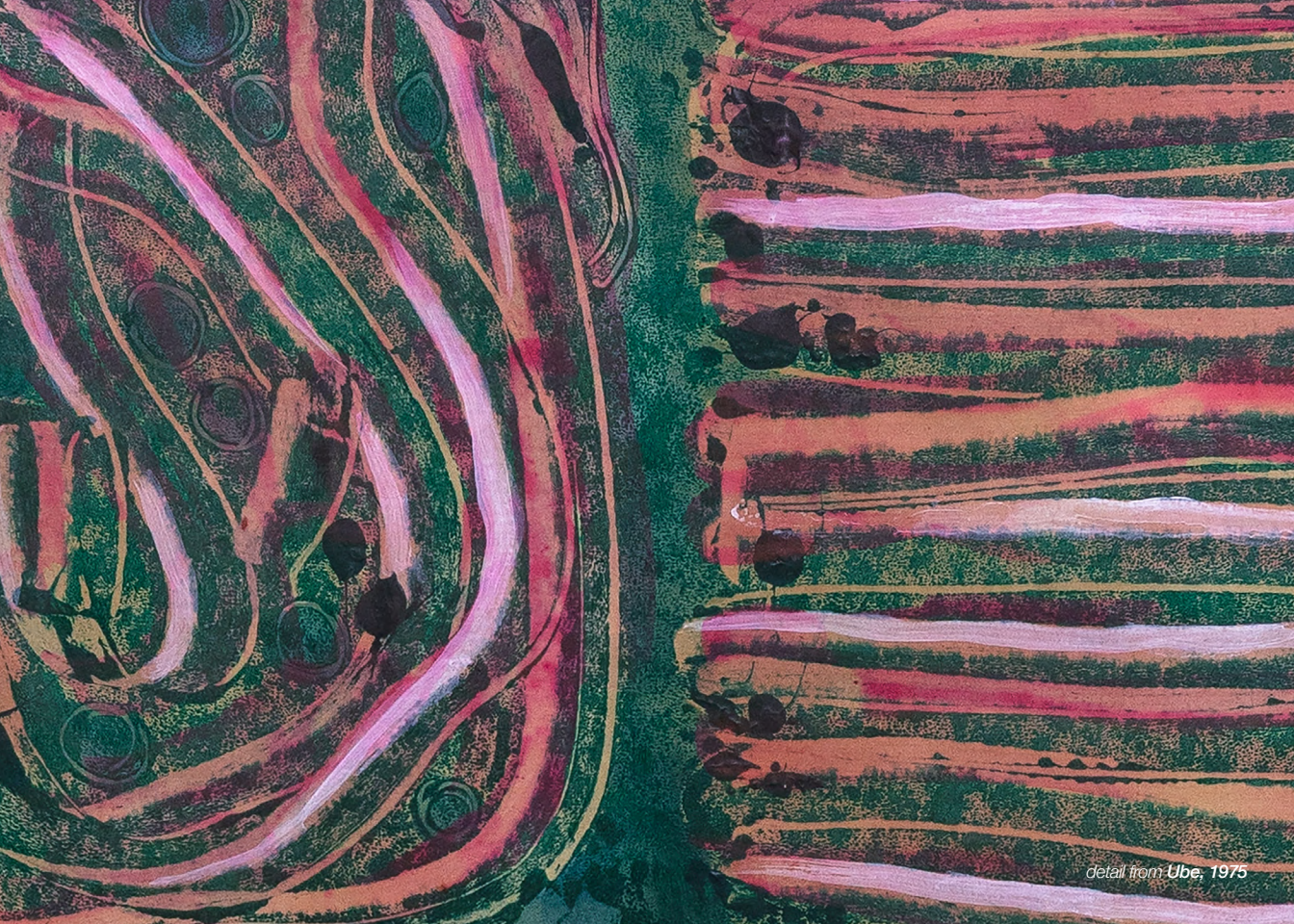
detail from Ube, 1975