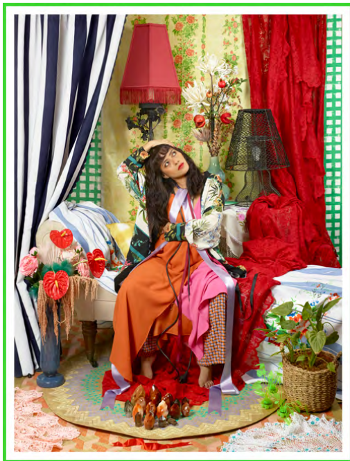
La Bruja II / Vagus (Self-Portrait Rebirthing the Self) ,2022 archival pigment ink on Hahnemühle Photo Lustre mounted on dibond artist's frame: glazed, colored frame with wooden mat board 58.5h x 45.25w x 2d in • 148.6h x 114.9w x 5.1d cm edition 4 of 7 plus 2 AP