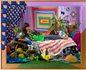
La Bruja (All the Places She's Gone, Self-Portrait), 2019