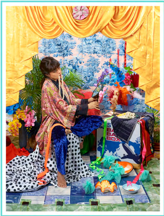
Mouth of Pearls / Oriental & Overseas (Self-Portrait) , 2022 archival pigment ink on Hahnemühle Photo Lustre mounted on dibond artist's frame: glazed, colored frame with wooden mat board 58.5h x 45.25w x 2d in • 148.6h x 114.9w x 5.1d cm edition 2 of 7 plus 2 AP