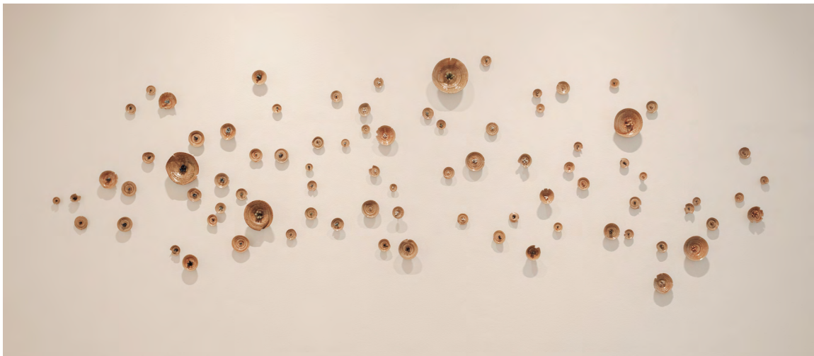
Bloom Field , 2024 high fired stoneware and porcelain dimensions variable