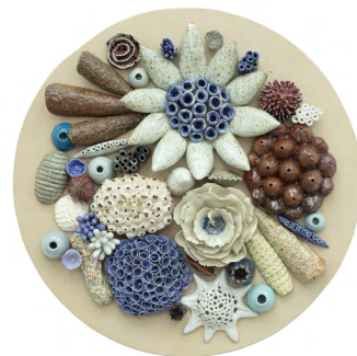
Radiance 5, 2023 high fired stoneware and porcelain 24 x 24 x 4 in | 61 x 61 x 10.2 cm