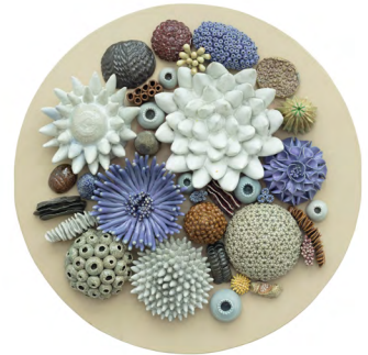
Radiance 4 , 2023 high fired stoneware and porcelain 24 x 24 x 5 in | 61 x 61 x 12.7 cm