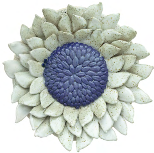
Radiance 3, 2023 high fired stoneware and porcelain 18 x 18 x 4 in | 45.7 x 45.7 x 10.2 cm