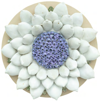
Radiance 2, 2023 high fired stoneware and porcelain 20 x 20 x 4 in | 50.8 x 50.8 x 10.2 cm