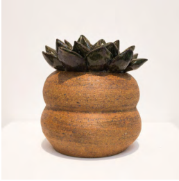
TP2 Covered Jar, 2018