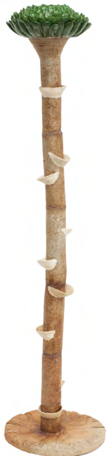
From The Desert 3 , 2019 stoneware and porcelain 38.0h x 9.0w in | 96.52h x 22.86w cm