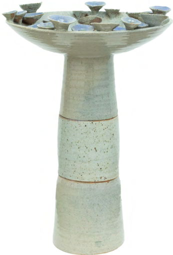
For the Birds and the Bees 2 , 2024 high fired stoneware and porcelain 21 1/2 x 16 in | 54.6 x 40.6 cm