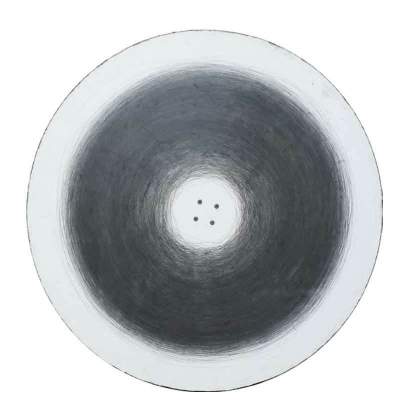
drawing in circle (no. 6), 2022

photo documentation of the artist's studio to the gallery variable dimensions SLABPANO26