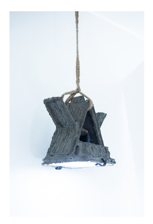
light suffers if there's no place to fall to (no. 10), 2021

LED light, plastic food container, and cement 15h x 11.50w in 38.10h x 29.21w cm SLABPANO40