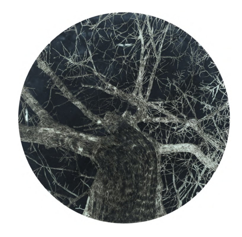
water table (no. 10), 2022

etched mirror 65cm in diameter SLABPAN018