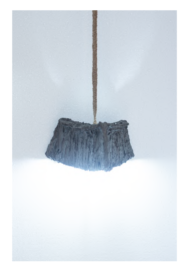
light suffers if there's no place to fall to (no. 34), 2021

LED light, plastic food container, and cement 5.12h x 10.63w in 13h x 27w cm SLABPANO43