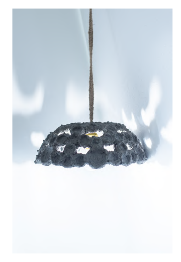
light suffers if there's no place to fall to (no. 33), 2021

LED light, plastic food container, and cement 5.91h x 11.81w in 15h x 30w cm SLABPANO42