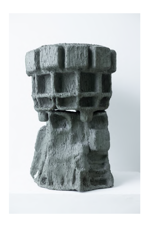
growing sound (no.24), 2021

plant, soil, plastic food container, and cement 31.50h x 19.69 diameter in 80h x 50 diameter cm SLABPANO33