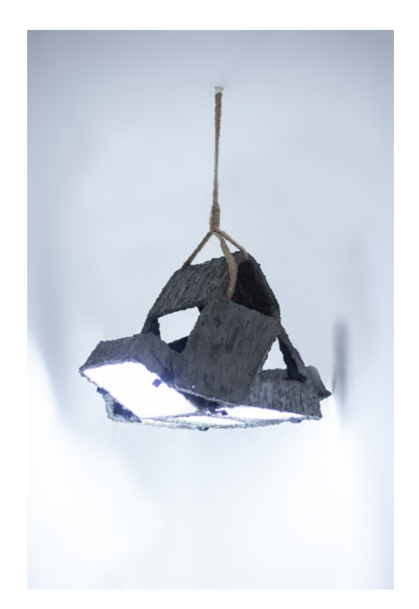
light suffers if there's no place to fall to (no. 4), 2021

LED light, plastic food container, and cement 7h x 22w in 17.78h x 55.88w cm SLABPANO36