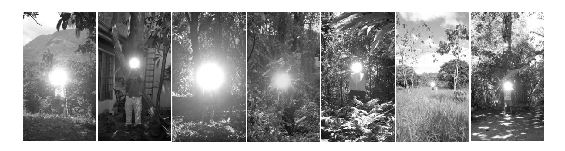
anonymity (set of 7), 2022

seven-channel video, no sound, each shown on a 24" wall-mounted flat screen