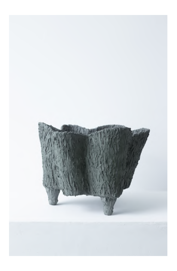
growing sound (no.20), 2021

plant, soil, plastic food container, and cement 14:17h x 14:17 diameter in 36h x 36 diameter cm SLABPANO27