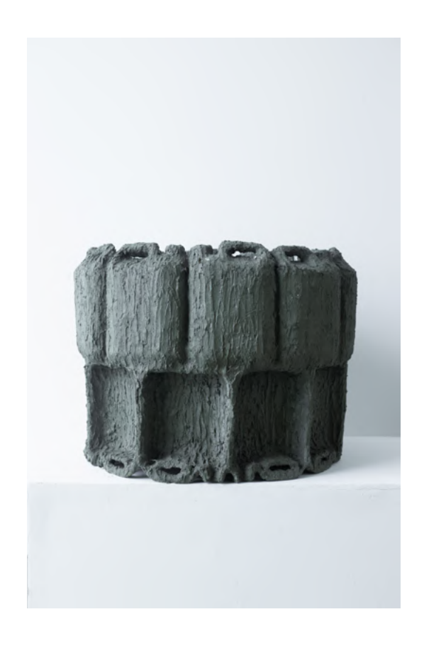
growing sound (no.21), 2021

plant, soil, plastic food container, and cement 19.69h x 26.38 diameter in 50h x 67 diameter cm SLABPANO31