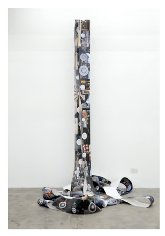
drawing in circle (series), 2022

photo documentation of the artist's studio to the gallery variable dimensions SLABPANO26