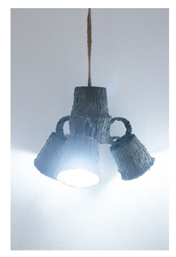
light suffers if there's no place to fall to (no. 7), 2021

LED light, plastic food container, and cement 15h x 11.50w in 38.10h x 29.21w cm SLABPANO40