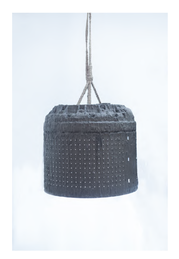
light suffers if there's no place to fall to (no. 35), 2021

LED light, plastic food container, and cement 5.12h x 10.63w in 13h x 27w cm SLABPANO43