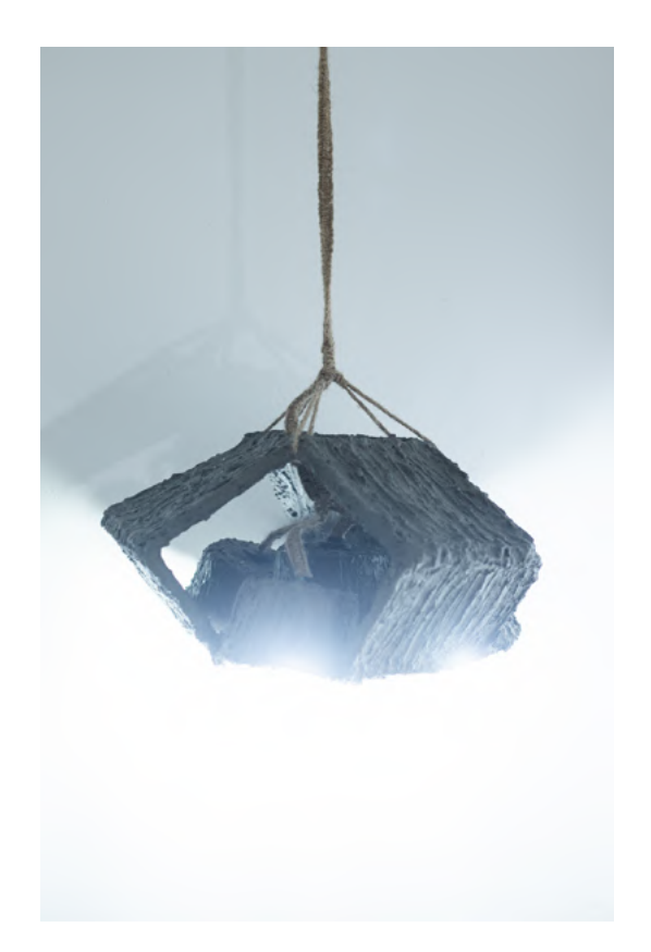
light suffers if there's no place to fall to (no. 5), 2021

LED light, plastic food container, and cement 5.91h x 11.81w in 15h x 30w cm SLABPANO42