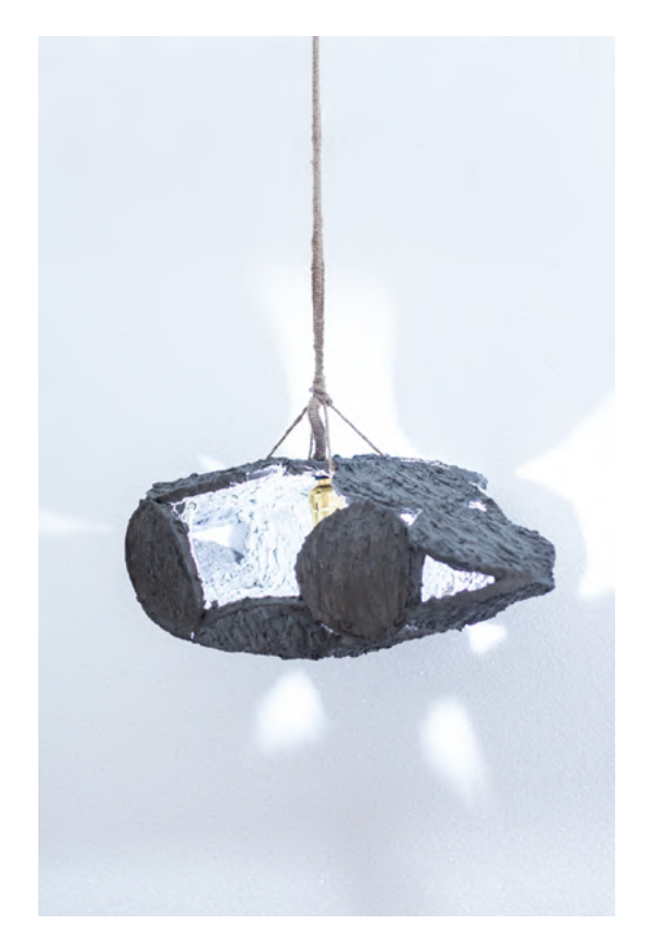
light suffers if there's no place to fall to (no. 1), 2021

LED light, plastic food container, and cement 7h x 22w in 17.78h x 55.88w cm SLABPANO36