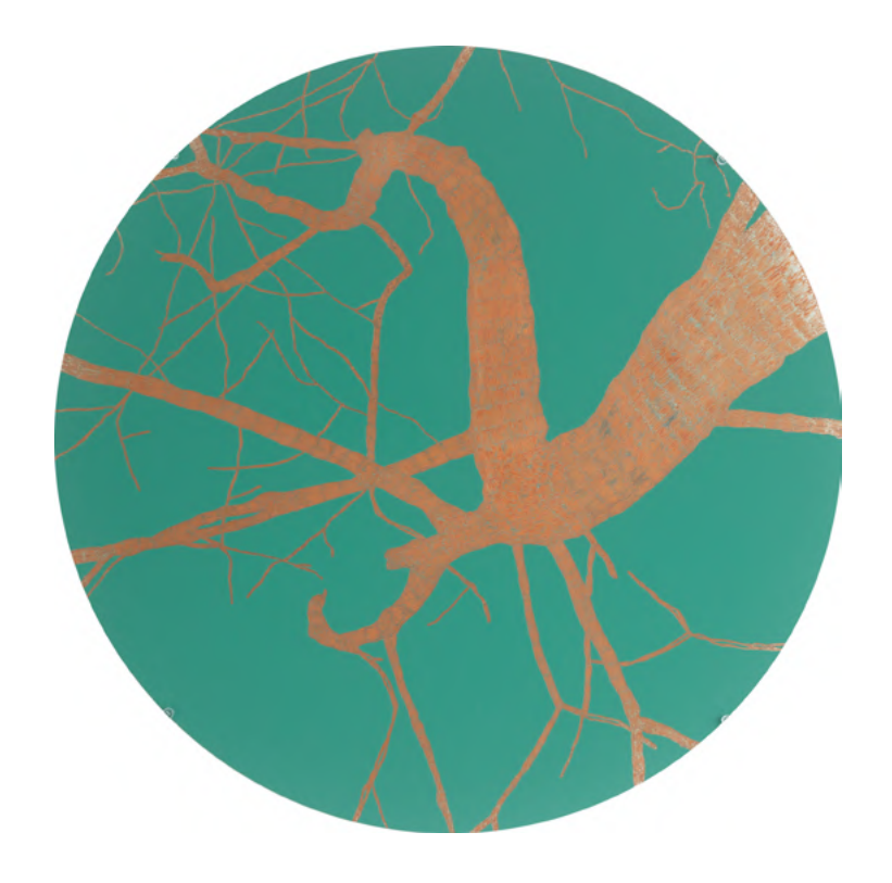
water table (no. 12), 2022

etched mirror 65cm in diameter SLABPAN017