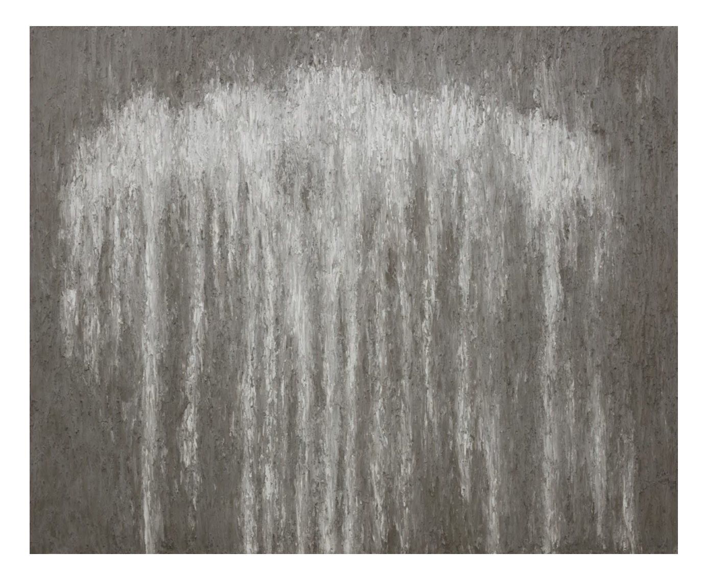
falling and growing (no. 7), 2022