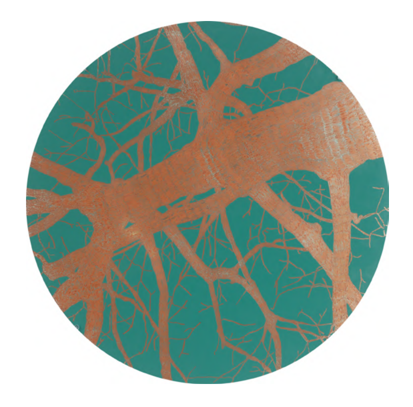
water table (no. 14), 2022

etched mirror 65cm in diameter SLABPAN016