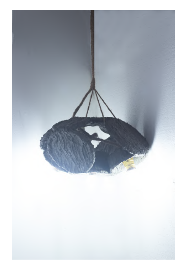
light suffers if there's no place to fall to (no. 6), 2021

LED light, plastic food container, and cement 7h x 15w in 17.78h x 38.10w cm SLABPANO39