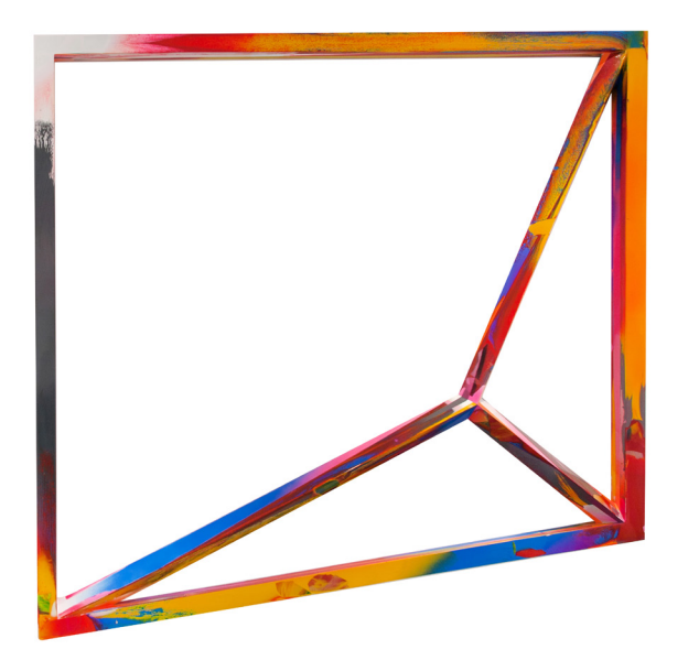
ARIN DWIHARTANTO SUNARYO Looking Through You, 2018