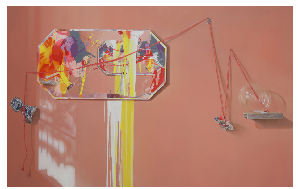
SYAGINI RATNA WULAN I see you, 2018