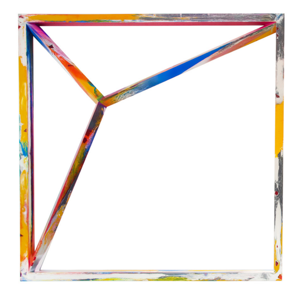
ARIN DWIHARTANTO SUNARYO Looking Through You, 2018