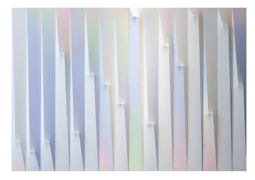
SYAGINI RATNA WULAN I see rainbow, 2018