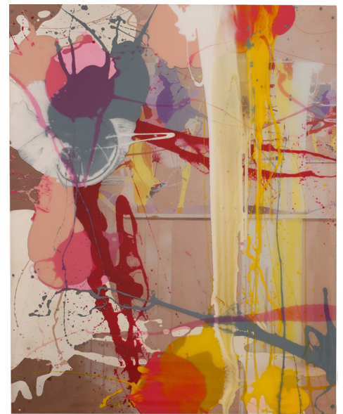
ARIN DWIHARTANTO SUNARYO U ees I, 2018