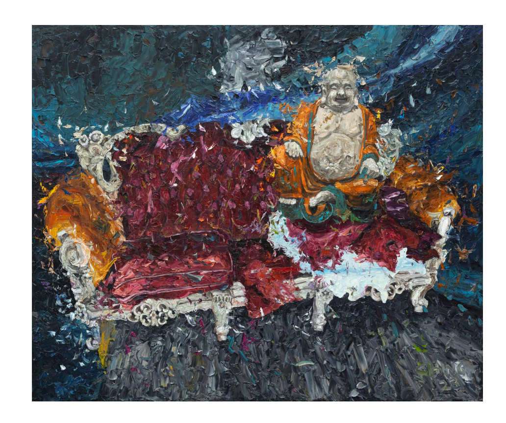
I Sit , 2023 oil on canvas 60h x 72w in • 152.40h x 182.88w cm