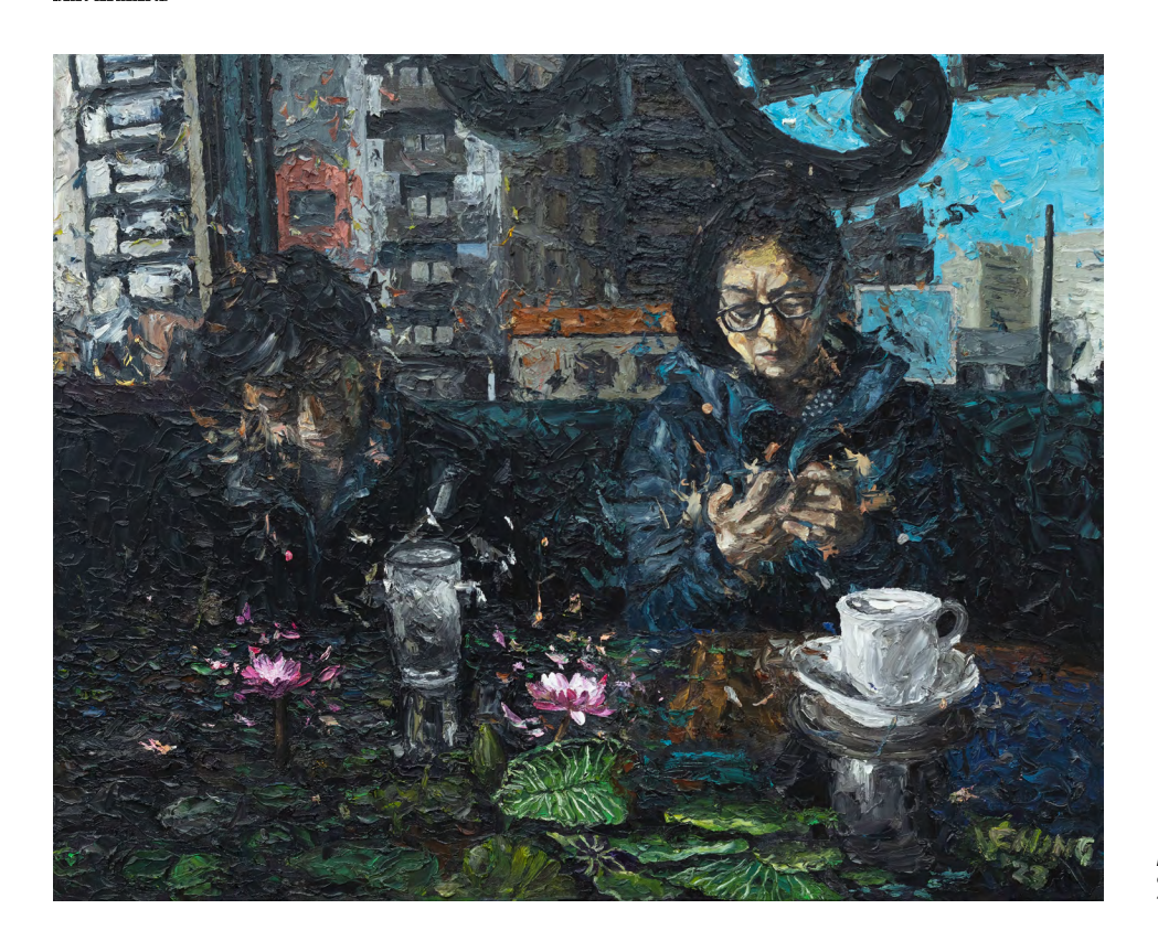
Enchanted Travellers 1, 2023 oil on canvas 48h x 60w in • 121.92h x 152.40w cm